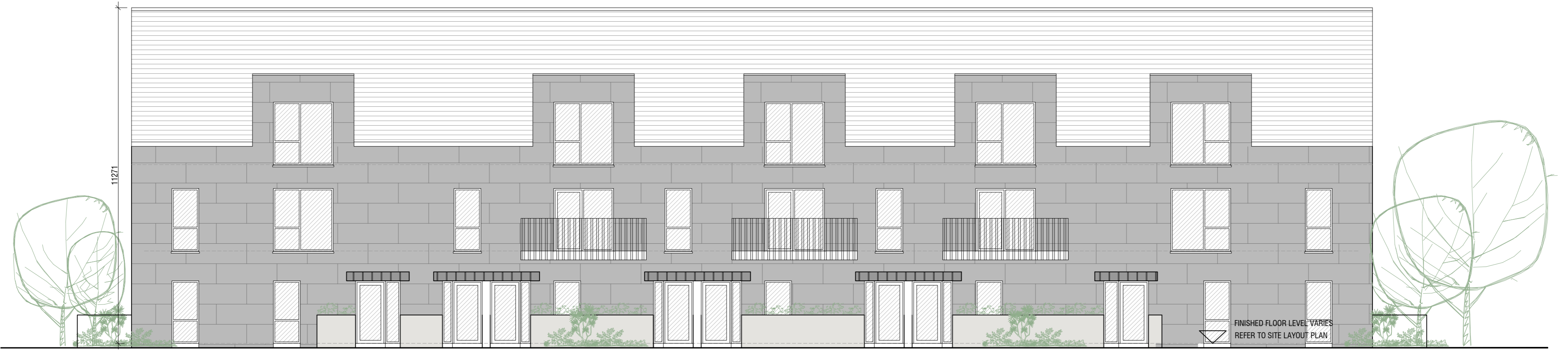
F3 FRONT ELEVATION 1:100