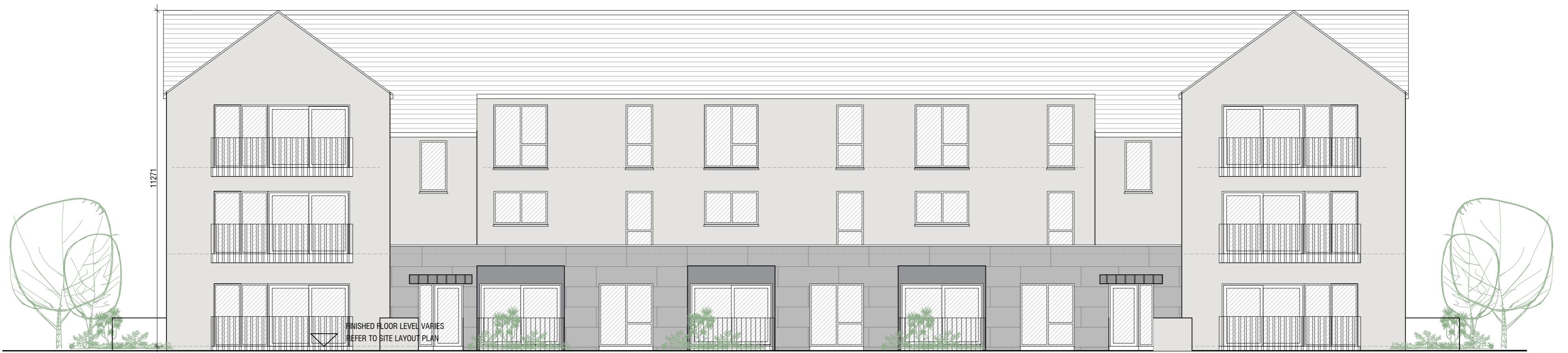
F3 REAR ELEVATION 1:100