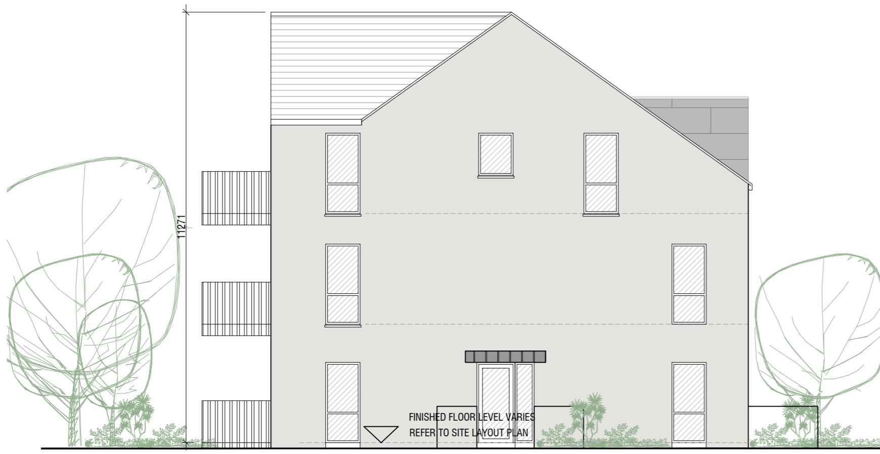
F3 SIDE ELEVATION 1:100