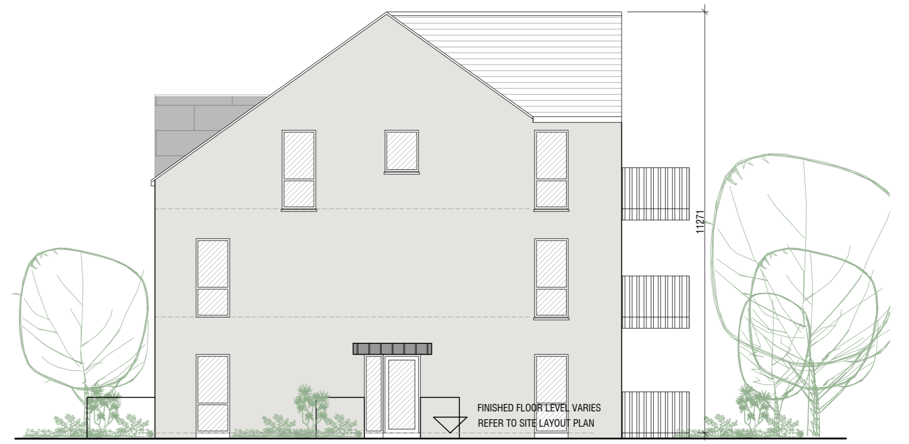
F3 SIDE ELEVATION 1:100