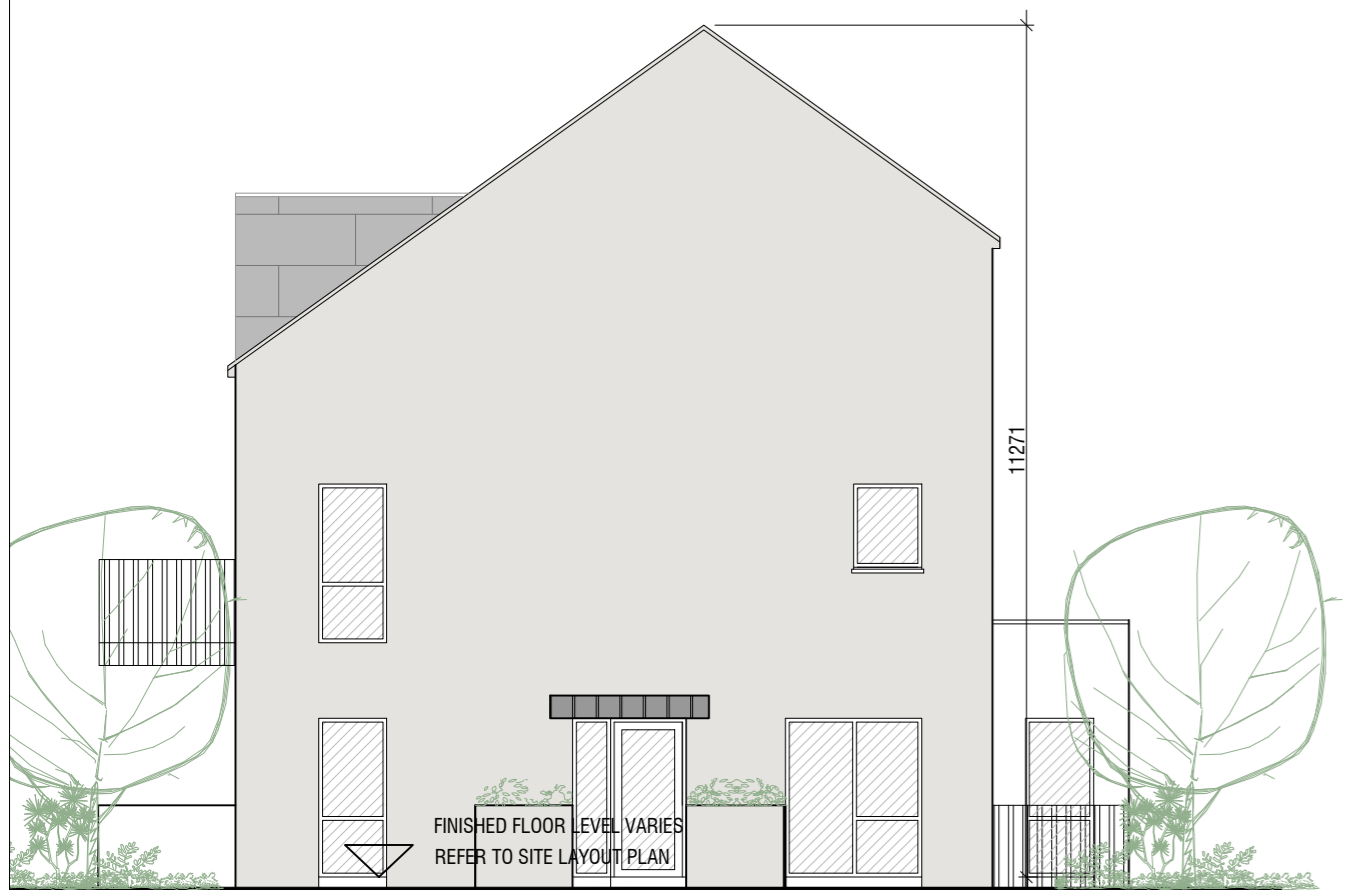
○ F2 SIDE ELEVATION 1:100