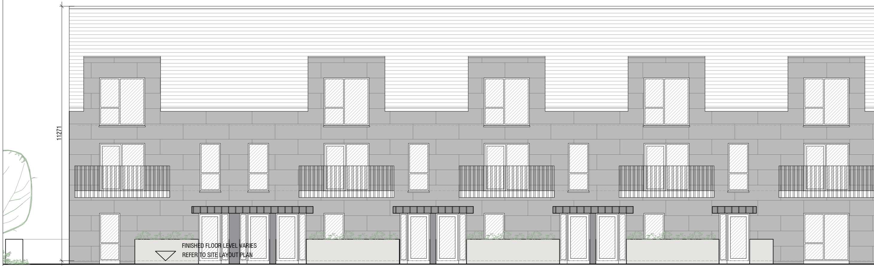
○ F2 FRONT ELEVATION 1:100