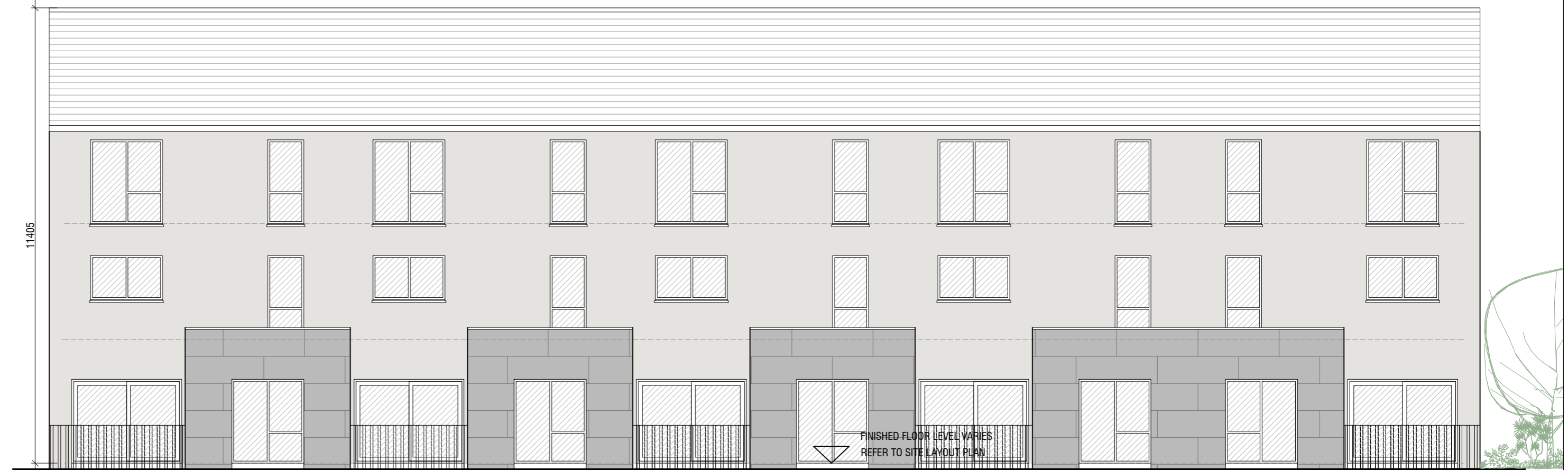
○ F2 REAR ELEVATION 1:100