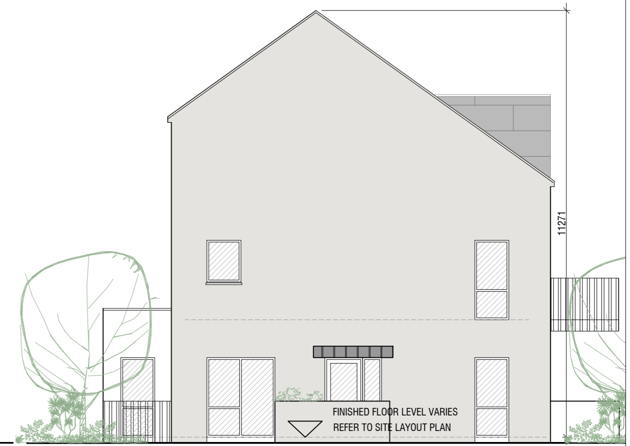
○ F2 SIDE ELEVATION 1:100