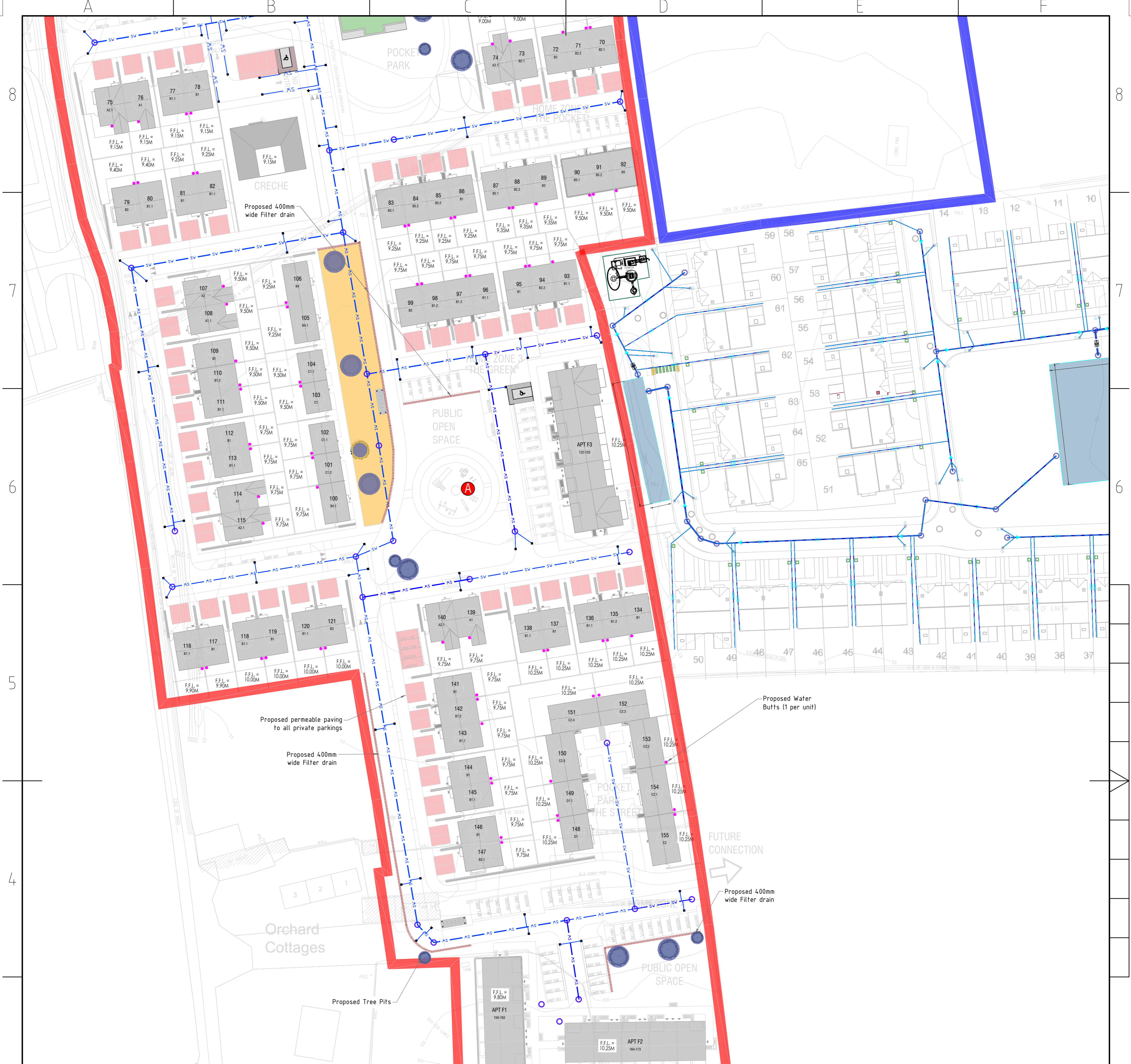
SITE WIDE SUD's SYSTEM - PROPOSED LAYOUT: PART B SCALE 1:500